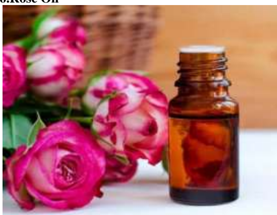
Fig 8: Rose oil

Saturate Your Lip Keeping your lips hydrated involving rosehip oil will help with keeping them full and lessening the appearance of kinks. Rosehip oil is significant for keeping up with lips smooth and youthful. Flexible lips: With a swipe of rosehip oil, meager, dry lips arise as stout and saturated, giving you a definitive celebrity frown! A few lip gleams guarantee to full your lips, in any case, saturating them consistently is an mind boggling strategy to keep up with your lips looking youthful and graceful.