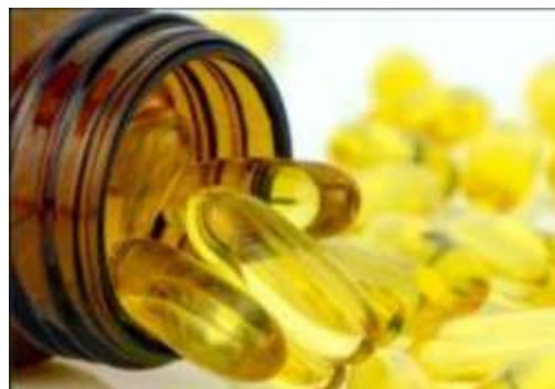
Fig 6:Vitamin E

Synonym : Eprolin, RRR-alpha-tocopherol, Vitamin-E,