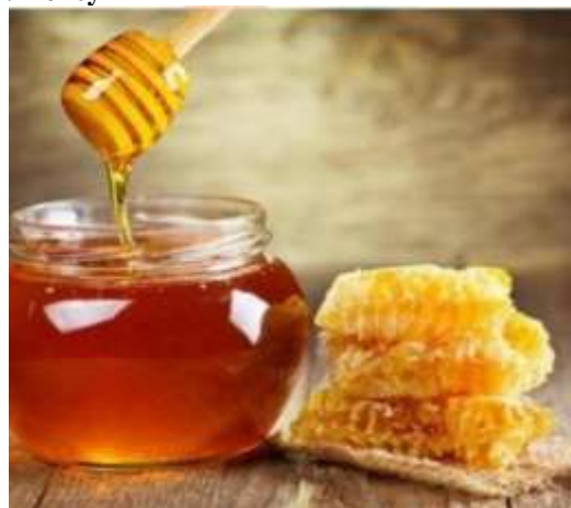
Fig 9: Honey

Honey is a characteristic humectant, and in view of this that it draws in and holds dampness, keeping your lips hydrated over the course of the day. Honey additionally has mitigating properties to assist with alleviating dried lips. Honey's antibacterial properties additionally help to forestall contamination assuming that the lips become broken. It has been reported that honey can facilitate removing necrotic tissues, increase the granulation and epithelialization speed, and reduce scars.