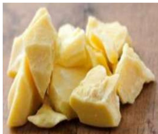
Fig 4:Honey bees wax