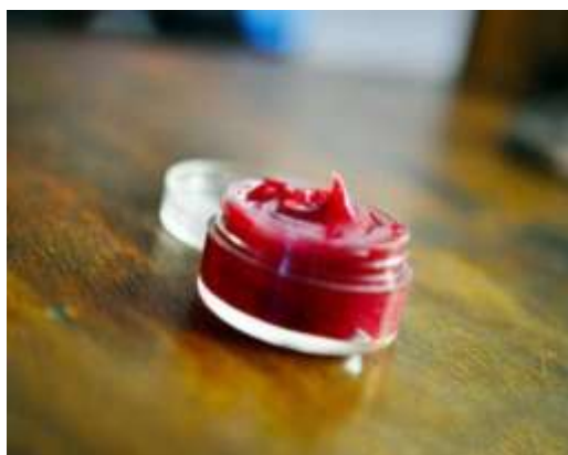
Fig 10: Herbal lip balm

organoleptic characters such as colour, odour, taste and appearance of lip balm was studied. [17]