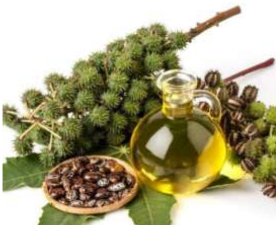
Fig 5:Castor oil

One of the benefits of castor oil for lips is that it might go about as a characteristic boundary that keeps water from getting away from your lips, thus keeping your skin from chipping or drying.