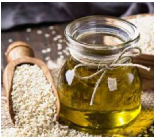
Fig 7: Sesame oil

It can speed the mending of sun related burns, breaks, injuries, and wounds Sesame Oil's compelling cell reinforcement and hostile to-provocative properties help to accelerate recuperation time and have moreover been demonstrated to animate collagen creation at the site of the injury.