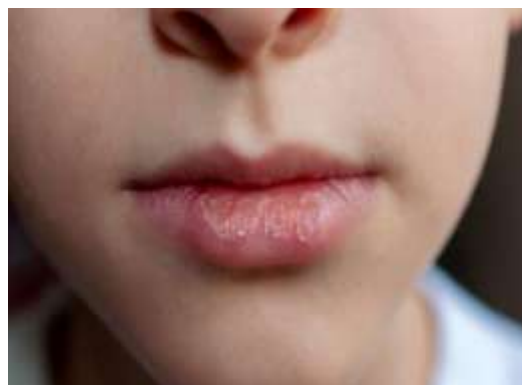
fig 2: Dry lips

Dry lips: The lips become parched and lose moisture when they get dry lips. Environmental variables such as low temperatures, dry air, or excessive lip-licking can be the cause of this. Dry lips might have a peeling, splitting, or tight feeling.