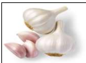
Fig 3: Alliums Sativum L.