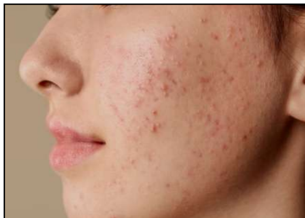
Fig. 1: Acnes

Acne develops because of blockage of follicles, hyperkeratinization and also keratin plug formation and sebum. Increased androgen production leads to sebaceous glands enlargement and sebum production is increased. Microcomedo may enlarge and form an open or closed comedo. Clogging of sebaceous glands with sebum, naturally occurring oil and dead skin cells results in the formaton of comedones.[1] Propionibacterium acne bacterias causes immflamation.[6]