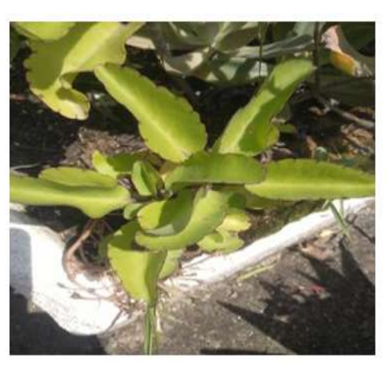
Fig No: 1 Kalanchoepinnata

Many medicinal qualities, involving CNS antidepressant, soothing antibiotic, anti-allergic, anti-anaphylactic, anti-tumors, anti-viral, antifungal, antimicrobial, febrifuge, sedative, anticancer, and anti-lithiasis.[10]