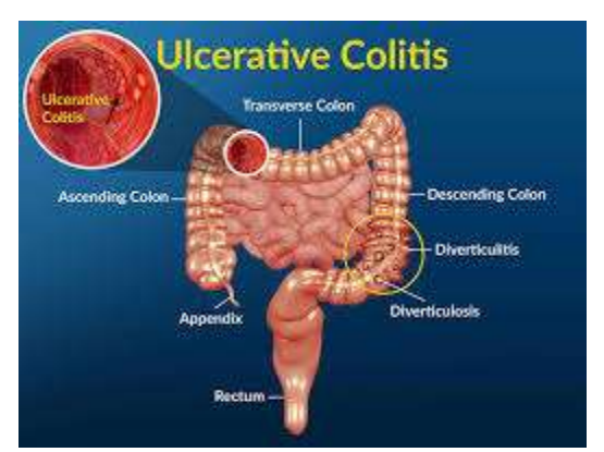
Fig.1 Ulcerative colitis.

Volume 9, Issue 3 May-June 2024, pp: 2012-2018 www.ijprajournal.com ISSN: 2456-4494