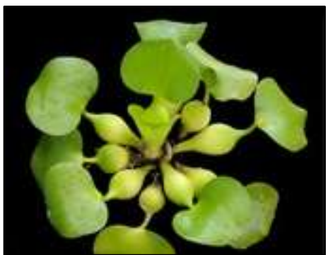
Fig. (1).Plant of Eichhornia crassipesshowing spongy stalk and stem[19]

adventitious root system, and to a lesser extent by seed.