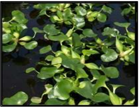
Fig. (4). Plant of Eichhornia crassipes[19]