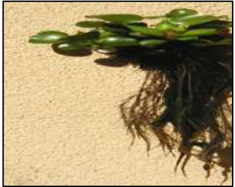
Fig. (3). Roots of Eichhornia crassipes[19]