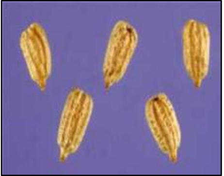
Fig.(6). Seeds of Eichhornia crassipes[19]