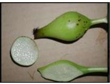
Fig. (5). Petioles of Eichhornia crassipes[19]