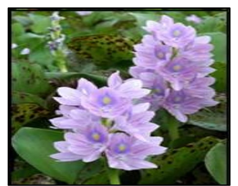
Fig. (2).Flowers of Eichhornia crassipes[19]