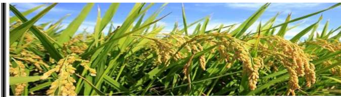
Fig No.: 1 Rice Bran

Rice bran oil is a form of oil produced from the hard outer layer of rice, which is known for its high smoke point and mild flavor. Rice bran oil is produced from rice bran, an oily layer in between the paddy husk and white rice. This oil is the oil extracted from the hard outer brown layer of rice called chaff or rice husk. It is known for its high smoke point of 232°C (450°F) and mild flavor, making it appropriate for high-temperature cooking methods such as stir frying and deep frying. The Rice bran oil is known as wonder oil for its numerous health advantages. It has a number of benefits over other edible oils because of the presence of a unique antioxidant known as oryzanol.