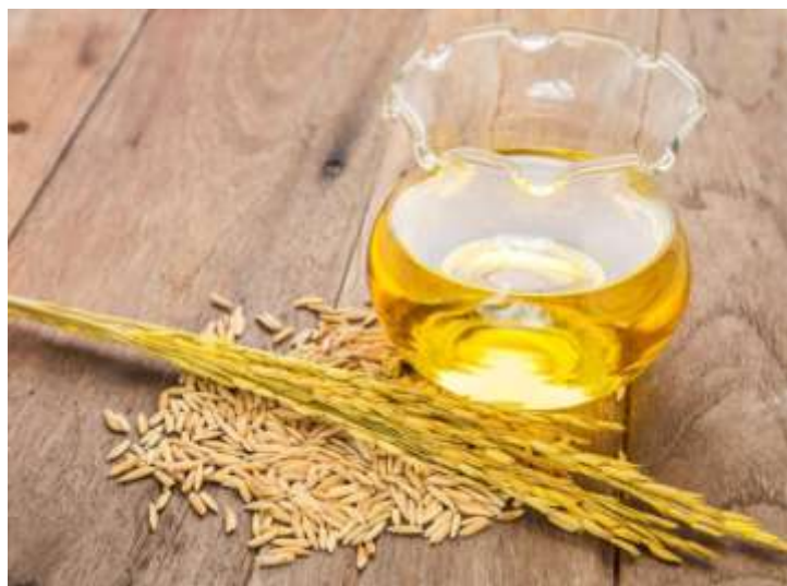
Fig No.: 2 Rice Bran Oil