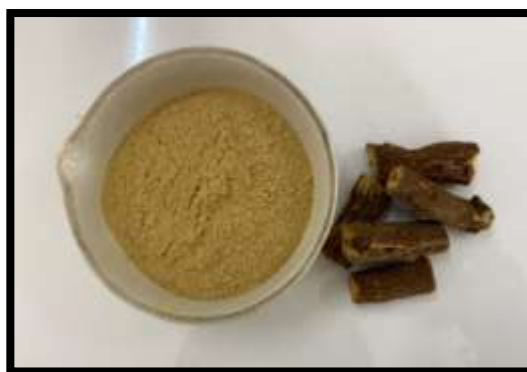
fig. liquorice roots and its extract powder.

Fracture: Fibrous in bark; and splintery in the wood.