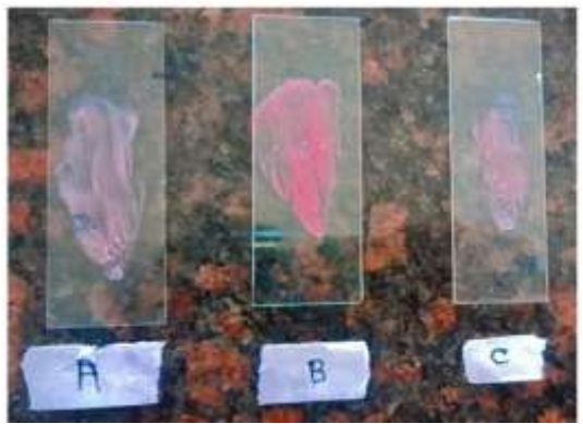
Figure 10: Spreadability test

of the lip attar, without any deformation at room temperature.