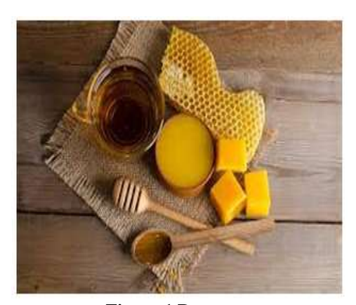
Figure 1 Bees wax

a) Bees wax: Beeswax is a water-resistant substance that has been used in cosmetics. In cosmetics, it serves as a thickening, emulsifying, and stiffening ingredient. Bee wax has the potential to aid with skin hydration. Beeswax is a naturally occurring emollient that helps to keep lips hydrated, shield them from the sun and wind, and keep their skin from being dry and irritated. Bee wax has softening and lubricating properties. Vitamins, minerals, and antioxidants found in beeswax are good for the skin.(11).