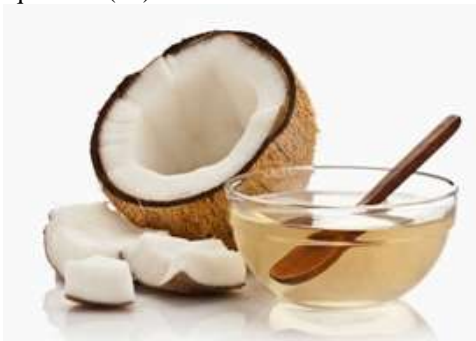
Figure 2 Coconut oil

Lauric acid, which is present in coconut oil, has nourishing, anti-fungal, and anti-microbial qualities.(11).