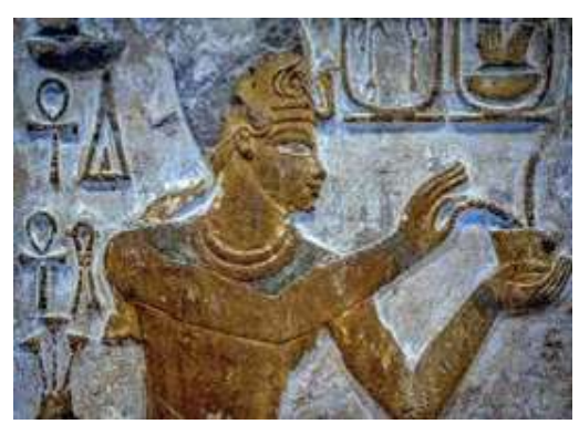
Figure 5 The origins of lip care

The history of lip balm can be traced back to earwax, and Charles Browne Fleet began commercializing it in the 1880s. This product, later called "ChapStick," became a household name. More than 40 years before Swift introduced lip balm to the market, Lydia Maria Child suggested in her enormously popular book The American Girl that chapped lips might be treated with earwax (6).