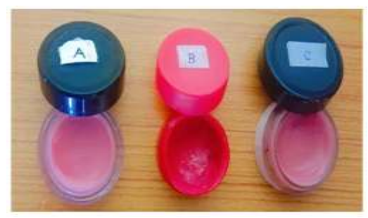
Figure 9: Natural lip balm by using rose petals

Prepared lip balm has shown faint pink colour with pleasant odour. All results are presented are as follows: