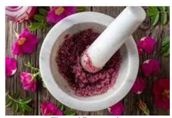
Figure 4 Rose petals

d) Rose petals: Rose petals can be used as an effective treatment for lightning dark lips. Rose petals are good source of vitamin C, iron, calcium, vitamin A. It exhibits a curious property known as hydrophobicity.(11).