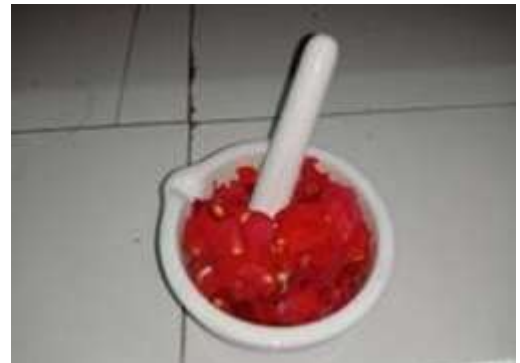
Figure8:Preparation of Rose petal soil extract