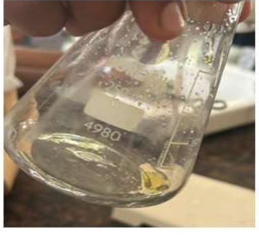
indicator and Titrated with 0.1M Potassium hydroxide solution.

10 ml of oil was added with 25ml of ethanol and 25ml of ether. Phenolphthalein was added as