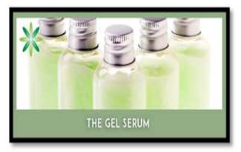
fig. 2.gel serum

1) The gel serum: -Gel serums provide the skin a "tightening" sensation that gives your customer the illusion that certain areas of their face have temporarily been lifted or tightened. Because this formulation is water-based, the gel serum gives you the opportunity to incorporate some amazing water-based (hydrophilic) plant extracts.