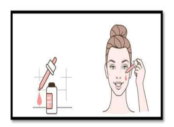
3) Make light circular movements.

2) Apply the equivalent of a pea:-It's Better to Less. Apply a small amount to your palm or directly onto your skin using a dropper, then gently massage it.