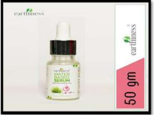
Fig .3.water based serum

3)The water based serum: -Gel and water-based serums are similar, albeit the former may or may not contain gums and thickeners. A water-based face serum would be used to apply high-performance hydrophilic plant extracts that are trapped against the skin beneath a cream or lotion. The best way to encourage increased skin penetration of water-based compounds and transport their high-performance components a little bit deeper into the skin's layers is to layer an anti-aging face mist under an emulsion and then under an oil. Higher component penetration will be facilitated by the occlusive barrier that the oils will create.