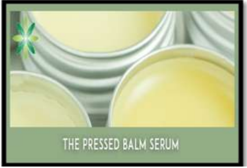
Fig.5.Pressed balm serum

5) The pressed balm serum:-A balm serum contains active ingredients that are oil-soluble (lipophilic) and may benefit the skin in addition to the traditional balm base of butters, waxes, and oils. The occlusive barrier that the butters and waxes create on the skin nourishes and moisturises it, enabling the active ingredients in the pressed serum to work. Numerous fascinating, one-of-a-kind butters and waxes can be blended with hundreds of fine plant oils to create a balm serum.