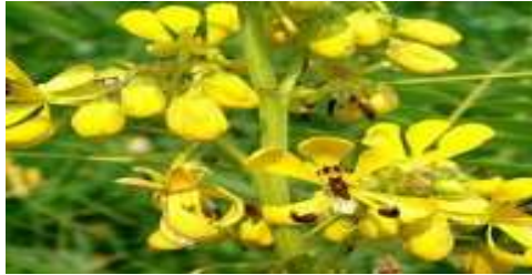
ORIGINAL DRUG (INDIAN SENNA)