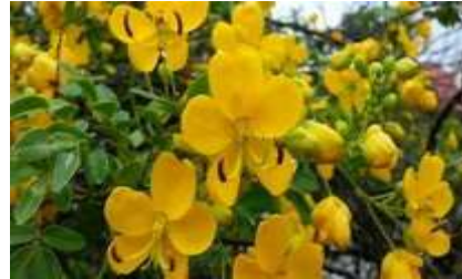
ADULTERATION ( ARABIAN SENNA)