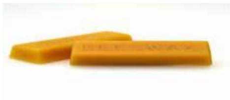
ORIGINAL DRUG (BEES WAX) ADULTERATION ( YELLOW COLOURED PARAFFINWAX)