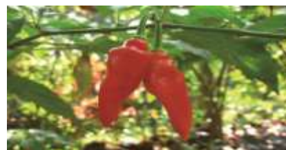
ORIGINAL DRUG(CAPSICUM MINIMUM) ADULTERATION (CAPSICUM ANNUM)