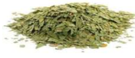
Senna leaves excess amount of vegetative part in senna leaves