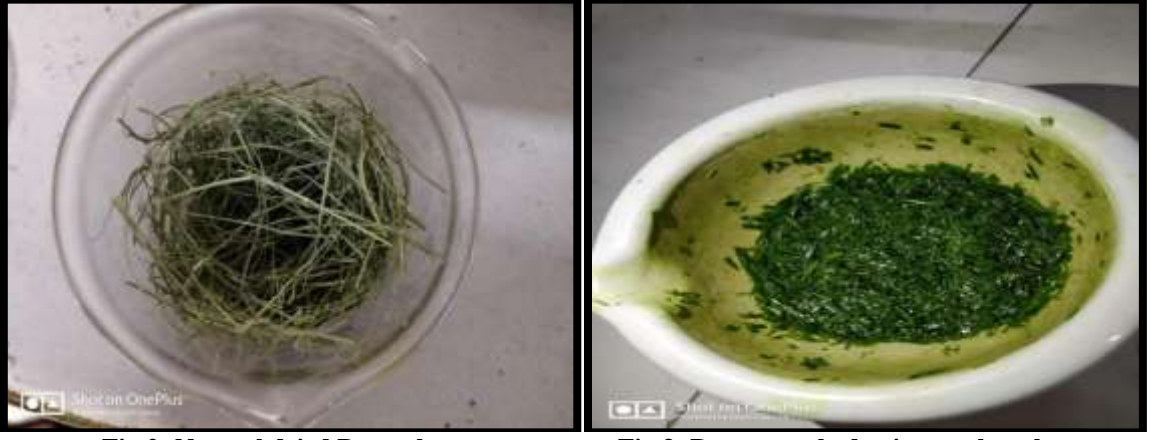
Fig 2: Natural dried Durva leaves

This zone is influenced by a number of variables, including the susceptibility test medium, the concentration of the test organism, the rate of growth of the test organism, the concentration of test sample, the diffusion of the test sample in the agar and the susceptibility of the organism to the test sample. The first five variables are standardized by CLSI; therefore, if the test is properly performed, the size of the zone of inhibited growth is directly related to the susceptibility of the organism —the larger the zone, the more susceptible the organism is to the test sample. As it would be expected, the results of the dilution tests and diffusion tests are related.