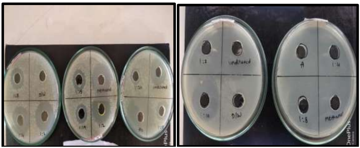
Fig 6a& 6b: Agar Cup Method of naturally available Cynodon dactylon against E.coli and S.aureu srespectively.