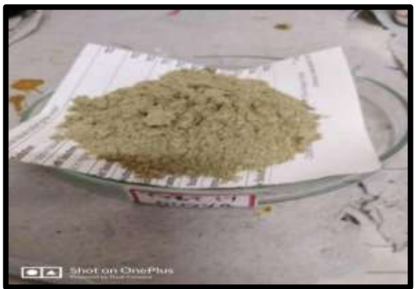
Fig 4: Commercially available powdered form of Cynodon dactylon

solutions were placed in a shaker incubator for 50 r.p.m for 24 hour. After 24hour, the suspension was filtered using Whatmann filter paper no.1 .The residual plant was dried completely to remove the respective solvents. The extract was washed once with distilled water to remove remaining solvents.