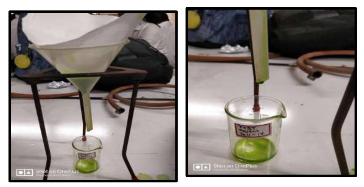
Fig 5a&5b: Filtration of the suspension using Whatmann filter paper no. 1.