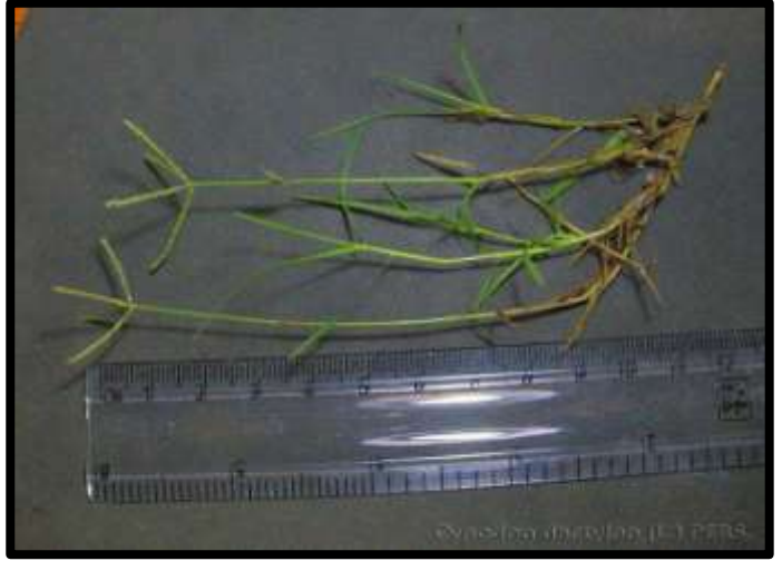
Fig 1- Cynodon dactylon

The plant contains crude proteins, carbohydrates, and mineral constituents, oxides of magnesium, phosphorus, calcium, sodium and potassium. The plant affords \beta -sitosterol, flavonoids, alkaloids, glycosides and triterpenoids. Other compounds like vitamin C, carotene, fats, palmitic acid etc. are also reported. Green grass contains 10.47% crude protein, 28.17% fiber and 11.75% of total ash.