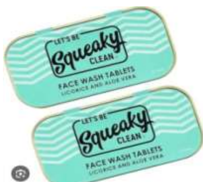
Fig no.5 - Squeaky clean (alovera and liquorise)