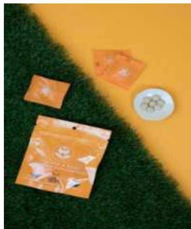
Fig no.3 - Feather and bone

Feather and Bone face wash tablets are a product designed to offer a more eco-friendly and sustainable way to cleanse your skin. These tablets typically contain natural ingredients and are packaged in a way that minimizes plastic waste. To use them, you dissolve a tablet with water, which creates a gentle, foaming face wash. The concept behind face wash tablets is to reduce packaging waste and provide a more concentrated form of product that lasts longer than liquid face washes. The ingredients often focus on being gentle on the skin and environmentally conscious.