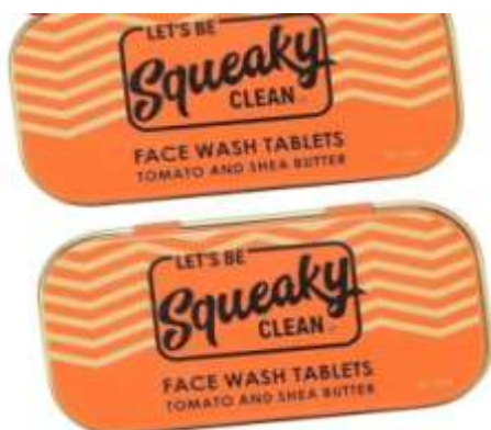
Fig no.6- Squeaky clean (tomato and shea butter)