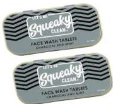
Fig no.4- Squeaky clean (charcoal and mint)

Face wash tablets that combine charcoal and mint, alover and liquorise , tomato and shea butter are an innovative skincare product designed to provide deep cleansing while refreshing and soothing the skin. Absorbs dirt, excess oil, and toxins. Helps to unclog pores and detoxify the skin. Improves skin clarity and prevents breakouts. Also provides a refreshing, cooling effect on the skin.