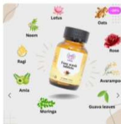
Fig no.2- Manitheer

2.4. Bawab. A. 2018 The Dead Sea Mud and Salt: A Review of Its Characterization, Contaminants, and Beneficial Effects. The Dead Sea has been known for its therapeutic and cosmetic properties. The unique climatic conditions in the Dead Sea area make it a renowned site worldwide for the field of climatotherapy, which is a natural approach for the provision of medications for many human diseases including unusual exclusive salt composition of the water, a special natural mud, thermal mineral springs, solar irradiation, oxygen-rich and bromine-rich haze. This review focuses on the physical, chemical, and biological characteristics of the Dead Sea mud and salts, in addition to their contaminants, allowing this review to serve as a guide to interested researchers to their risks and the importance of treatment. Beneficial effects of Dead Sea mud and salts are discussed in terms of therapy and cosmetics. Additional benefits of both Dead Sea mud and salts are also discussed, such as antimicrobial action of the mud in relation to its therapeutic properties, and the potency of mud and salts to be a good medium for the growth of a halophilic unicellular algae, used for the commercial production of \beta -carotene; Dunaliella.