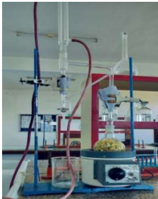
iv) Distillation of jasmine oil

In order to produce a consistent, stable result, the procedure uses physical mixing and