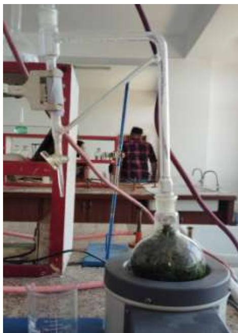
iii) Distillation of eucalyptus oil