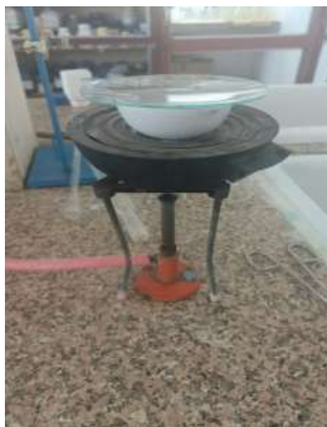
ii) Melting of paraffin wax