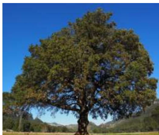
Camphor tree ( Cinnamomum camphora )

cineol, linalool, eugenol, limonene, safrole, nerolidol, borneol, camphene, and several other derivatives, camphor is the primary constituent of the leaves of Cinnamomum camphora . Through the intermediary dehydron-orbornyl chloride, camphor may also be derived from vinyl chloride and cyclopentadiene. Budvar and Reynolds (1989) analysed the synthetic form, which is optically inactive, whereas the natural form is dextrorotatory.