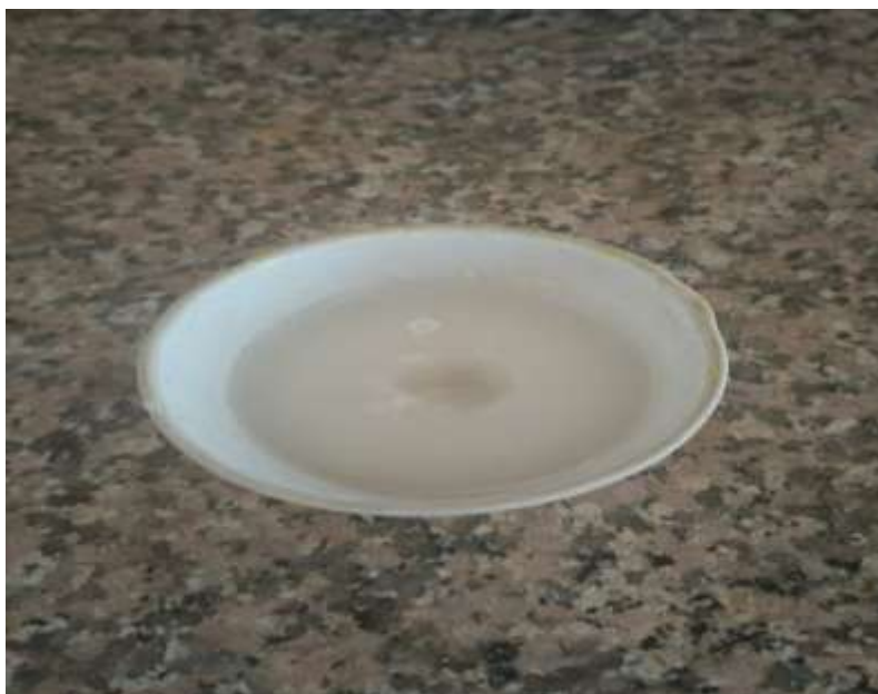
Final Product (Camphor Balm)

dissolving techniques rather than chemical reactions.