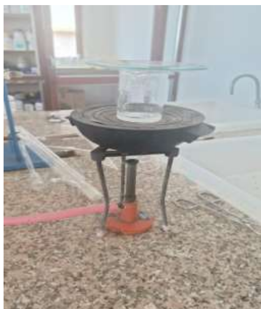
i) Melting of petroleum jelly

Because the method involves mixing and dissolving materials rather than generating chemical reactions to produce new compounds, the major chemical interactions in this formulation are physical rather than chemical. The main exchanges and modifications that take place are described below. When heated, petroleum jelly and paraffin wax melt and create a uniform basis. They merely undergo a phase transition from solid to liquid; no chemical reaction takes place.