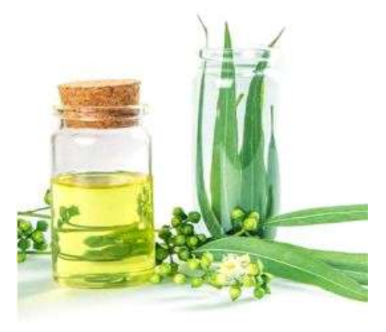
Fig.1 Eucalyptus Oil

International Journal of Pharmaceutical Research and Applications Volume 5, Issue 2, pp: 771-781 www.ijprajournal.com ISSN: 2249-7781