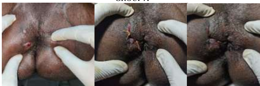
Before Treatment During Treatment After Treatment