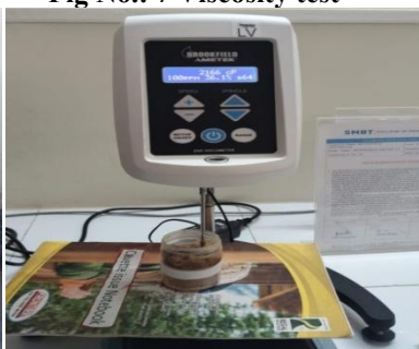
Fig No.: 7 Viscosity test