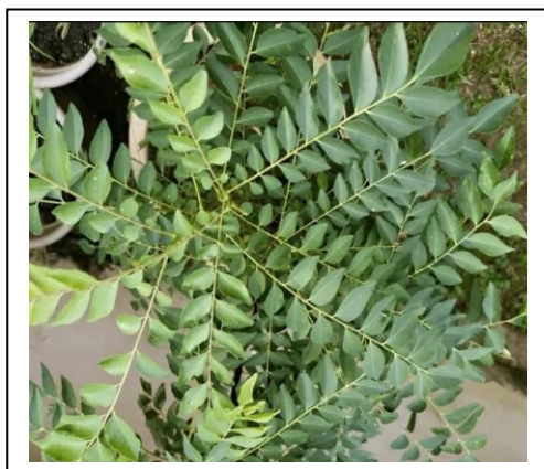
FIG 01: MURRAYA KOENIGII FIG 02: TINOSPORA CARDIFOLIA