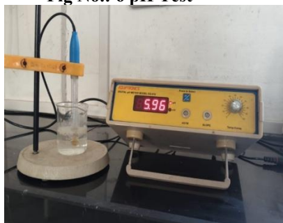
Fig No.: 6 pH Test