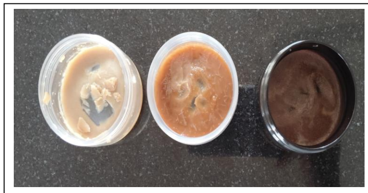
Fig No.: 4 Formulation of Murraya koenigii and Tinosporacardifolia Cream