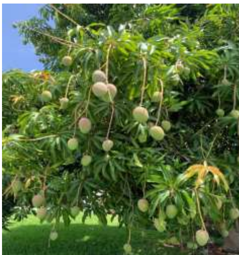
Mangifera indica tree

Mangifera indica , a large evergreen tree in the Anacardiaceae family, is dome-shaped, has dense foliage, and is usually heavy-branched from a robust trunk. It can reach a height of 10 to 45 meters.(12) The leaves vary in size and range in length from 15 to 45 cm. The length of a leaf petiole varies from 1 to 10 cm. M. indica leaves come in a variety of shapes, including oblong, oval, roundish-oblong, linear-oblong, ovate-lanceolate, and lanceolate. Some mango varieties have green, red, or yellow leaves, and the tops of the leaves are typically glossy. (13)The terminal inflorescence consists of long panicles that contain both male and female flowers. It is a pyramidal, branched, erect, and ostentatious flower cluster. Small, reddish-yellow flowers are produced. In the winter and spring, it blooms. Blossoms smell sweet. There is only one seed in the juicy, meaty fruit. Oval, kidney-shaped, ovoid-oblong, or nearly round fruits are all possible. The kidney-shaped seed is oval or flattened and pale yellowish-white. The fruit has a hairy cover that protects it. (14)