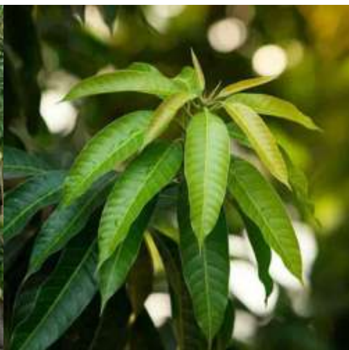
Mangifera indica leaves