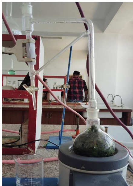
iii) Distillation of eucalyptus oil