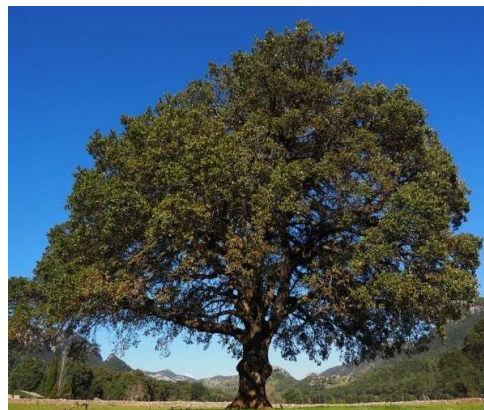
Camphor tree ( Cinnamomum camphora )

has a unique blend of essential oils. Along with cineol, linalool, eugenol, limonene, safrole, nerolidol, borneol, camphene, and several other derivatives, camphor is the primary constituent of the leaves of Cinnamomum camphora . Through the intermediary dehydron-orbornyl chloride, camphor may also be derived from vinyl chloride and cyclopentadiene. Budvar and Reynolds (1989) analysed the synthetic form, which is optically inactive, whereas the natural form is dextrorotatory.