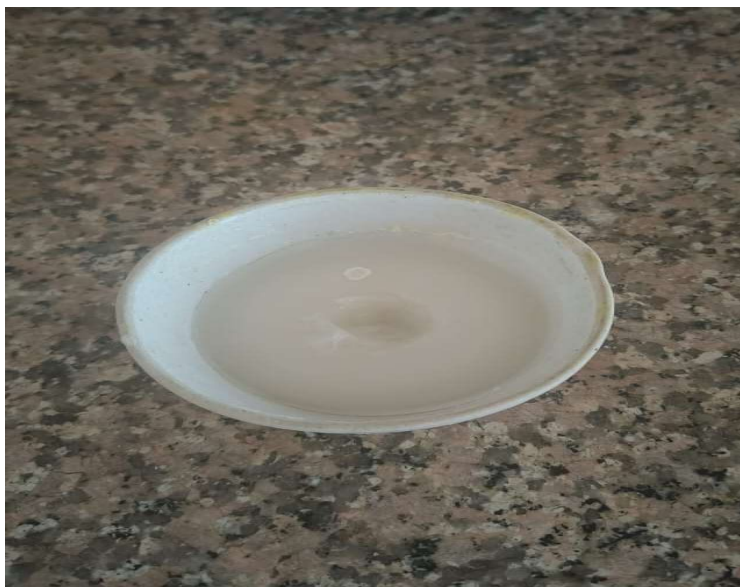
Final Product (Camphor Balm)

dissolving techniques rather than chemical reactions.