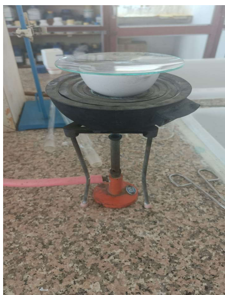
ii) Melting of paraffin wax