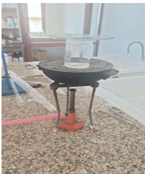
i) Melting of petroleum jelly

Because the method involves mixing and dissolving materials rather than generating chemical reactions to produce new compounds, the major chemical interactions in this formulation are physical rather than chemical. The main exchanges and modifications that take place are described below. When heated, petroleum jelly and paraffin wax melt and create a uniform basis. They merely undergo a phase transition from solid to liquid; no chemical reaction takes place.