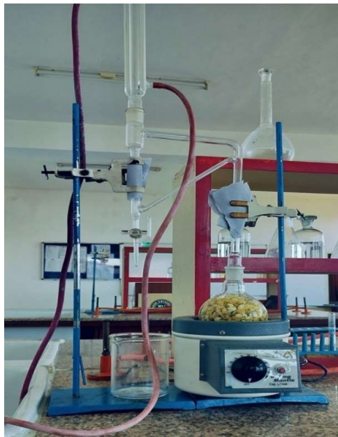
iv) Distillation of jasmine oil