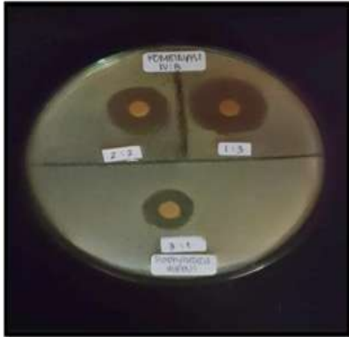
Figure 3. Best Combination Antibacterial Activity Test on Ethanol Extract of Jackfruit Leaves and Star fruit Leaves in a ratio of 1:3

bacterial cells are stopped because all metabolic activities of bacterial cells are catalyzed by enzymes which are proteins (Marfuah et al., 2018).