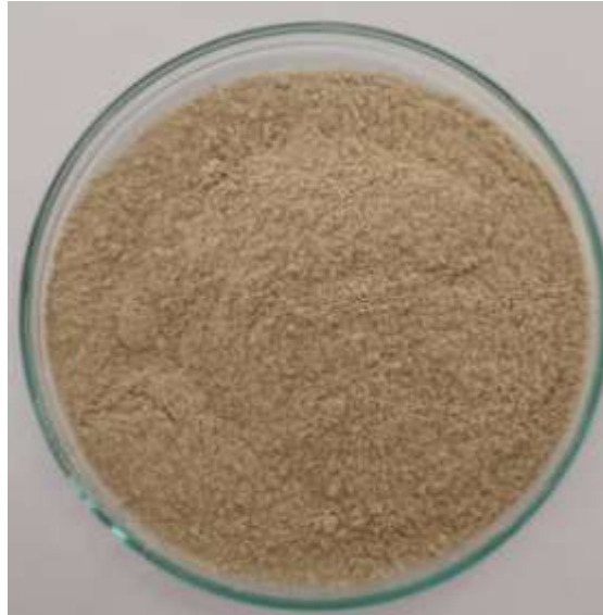
Fig.1 a: Erandamoola ( Ricinus communis L. root) powder