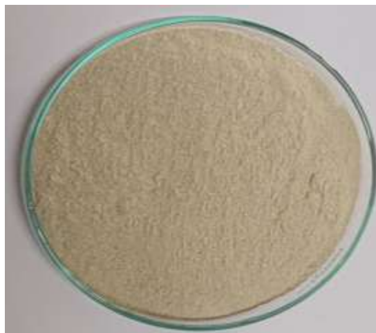
Fig.1 a: Pushkarmoola ( Inula racemosa Hook.F) root powder