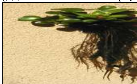
Fig. (3). Roots of Eichhornia crassipes [19]