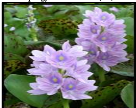
Fig. (2). Flowers of Eichhornia crassipes [19]