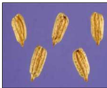
Fig.(6). Seeds of Eichhornia crassipes [19]