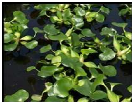
Fig. (4). Plant of Eichhornia crassipes [19]

Reproduction: By fragmentation of stolons, adventitious root system, and to a lesser extent by seed.