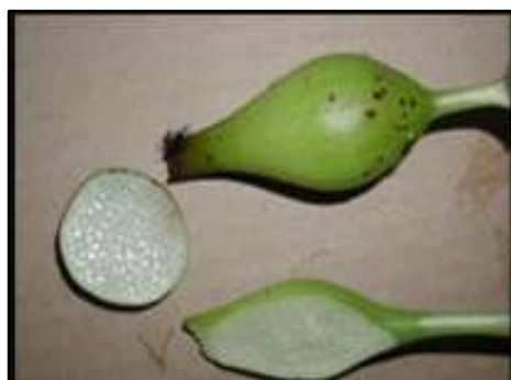
Fig. (5). Petioles of Eichhornia crassipes [19]