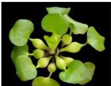
Fig. (1). Plant of Eichhornia crassipes showing spongy stalk and stem[19]