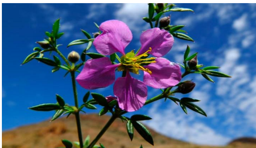
Photographic image of fagonia arabica L .

Fagonia arabica L. is a medicinal plant classified within the Zygophyllaceae family, extensively acknowledged for its therapeutic potential and traditional applications across various regions, particularly in arid and semi-arid environments. This drought-resistant shrub is distinguished by its thorny branches and small, delicate flowers, and it prospers under harsh climatic conditions where few other species can survive. Fagonia arabica has garnered significant scientific interest owing to its diverse bioactive constituents, including flavonoids, alkaloids, and saponins, which underpin its pharmacological activities such as anti-inflammatory, antioxidant, antimicrobial, and anticancer effects. The plant's traditional uses encompass the treatment of fever and inflammation as well as the management of chronic diseases, underscoring its importance in ethnomedicine. Contemporary research endeavors seek to substantiate these traditional claims and investigate its potential for the development of novel therapeutic agents. [1,2,3]