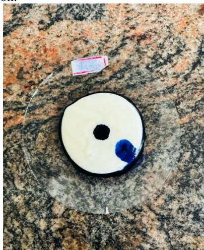
Determination of emulsion type

Colouring is given to lotion by adding methylene blue. The preparation is homogeneous with methylene blue so lotion is an o/w type emulsion.