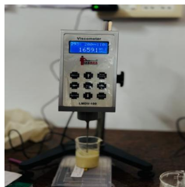
Determination of viscosity using brook field viscometer.

suitable viscosity for topical preparation in the form of lotion is 2000-50000.