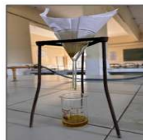
Fig 9: Extraction of oil