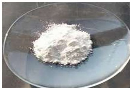
Fig 8: Zinc oxide