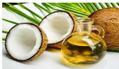
Fig 7: Coconut oil

Coconut obtained from the hard, dried endocarp consists of a mixture of triglycerides of saturated fatty acids. The oil contains about 95% of saturated fatty acids with 8 and 10 carbon atoms. It shows the presence of caprylic acid, 2%; capric acid, 50–80%; lauric acid, 3%; and myristic acid about 1%.