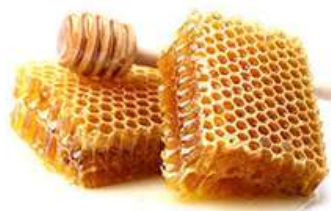
Fig 3: Bees wax

Beeswax is a complex mixture of various chemical compounds. Unhydrolyzed Beeswax consists of approximately 71% esters, 15% hydrocarbon, 8% free fatty acids, 6% other compounds.