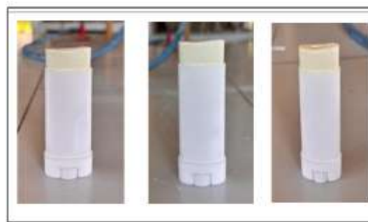
Fig 14: Stability study

The formulation was subjected to accelerated stability conditions by storing it at room temperature for several days. Any change or instability were recorded.