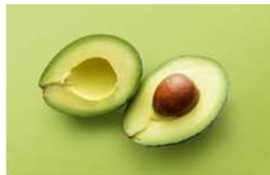
Fig 2: Avocado

docosadienoic acid, palmitoleic acid, linolenic acid, and eicosenoic acid