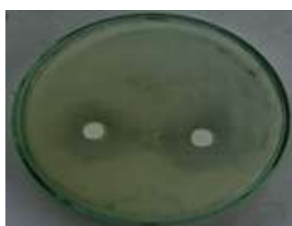
Fig 13: Anti-microbial test of sunscreen stick

sterile swab. Using a sterile cork borer or similar tool, make wells in the agar plate. Place a small amount of sunscreen formulation one well and marketed sunscreen in another well using sterile applicator stick. Incubate the plate at an appropriate temperature for the microorganism (e.g. 37°C) for a specific period of time (e.g., 24 hrs). Measure the diameter of zone of inhibition around each well where no growth is present. This indicates the antimicrobial activity of the formulation.