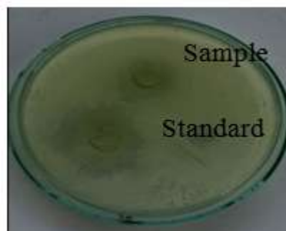
Fig 10: Anti-microbial test of oil

Prepare a culture of the micro-organism that you want to test the oil against (eg Escherichia Coli) Incubate the agar plate with the microorganism by spreading a small amount of the culture evenly across the surface of the agar using a sterile swab. Using a sterile cork borer or similar tool, make wells in the agar plate. Place a small amount of oil in one well and other well with standard using a sterile applicator stick. Incubate the plate at an appropriate temperature for the microorganism. (e g 37°C) for a specified period of time (e g 24 hours) Measure the diameter of the zone of inhibition around well where no growth is present. This indicates the antimicrobial activity.