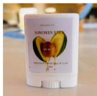
Fig 15: Herbal sunscreen stick

The sunscreen stick remains stable at evaluated temperature of 36-40°C for 28 days, with no significant changes in colour, Spreadability, appearance and fragrance.