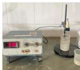
Fig 12: pH of sunscreen stick

The pH of sunscreen was determinant using a digital pH meter. The pH was measured after 1g of the formulation was dissolved in 100ml of newly prepared distilled water for 2 hours. The purpose of this study was to guarantee that pH of the produced herbal sunscreen is similar to the pH of the skin after 24 hours of use. The result was checked and was recorded. [1]