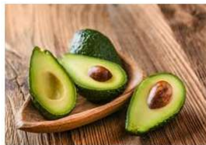
Fig 1: Avocado fruit

Avocado oil ( Persea americana ) consists mainly of fatty acids where oleic acid is its major component.