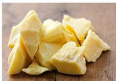
Fig 4: Cocoa butter

It consists of glycerides of stearic (34%), palmitic (25%), oleic (37%) acids, and small amount of linoleic acids and arachidic acid. Glyceride structure is responsible for non-greasiness of product.