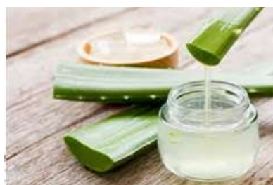
Fig 5: Aloe vera gel

Aloe vera contains over 200 chemical constituents. The two-main active constituents of the aloe vera plant extract are chromone and anthraquinone and its glycoside derivatives.