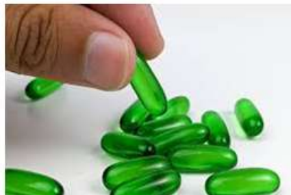
Fig 6: Vit E capsule