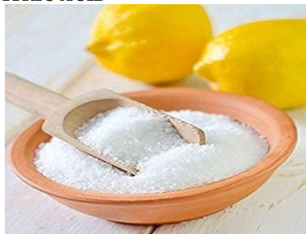
Figure. No. 10

IUPAC Name : 2-Hydroxypropane-1,2,3-tricarboxylic acid