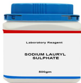
Figure. No. 12

IUPAC Name: Sodium dodecyl sulphate or SDS