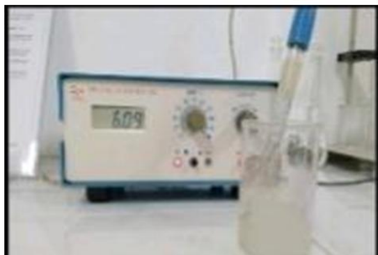
Figure. No. 15