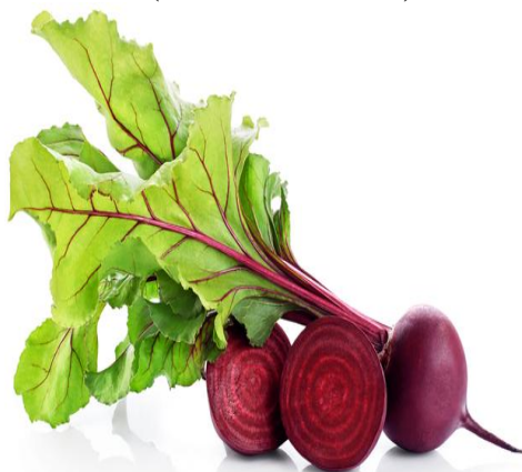
Figure. No. 5