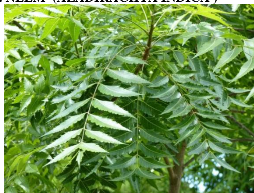
Figure. No. 2