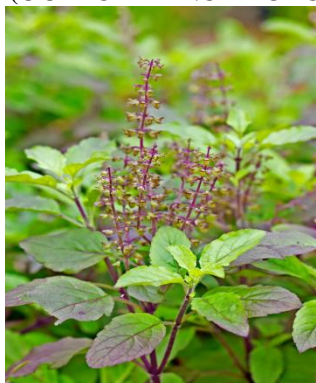
Figure. No. 1