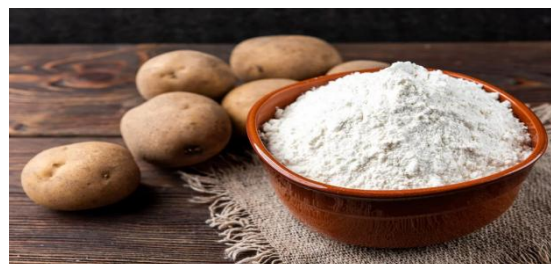
Figure. No. 13

Use: Helps to remove dirt and dead skin cells from skin surface