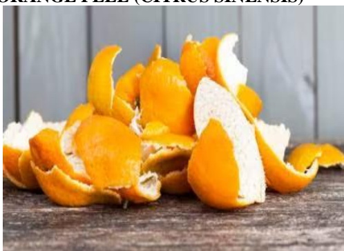
Figure. No. 4