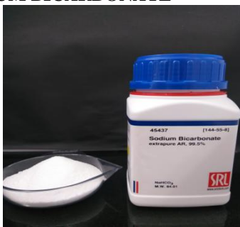
Figure. No. 11