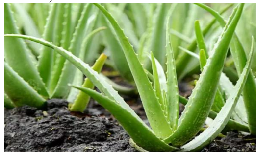
Figure. No. 6