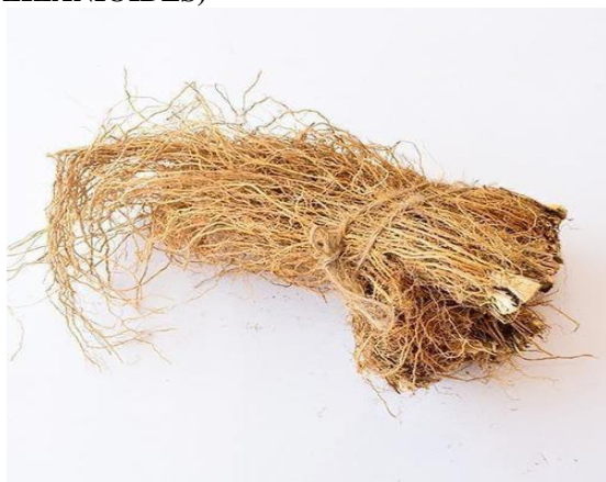
Figure. No. 7