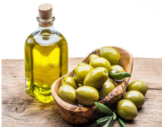
Figure. No. 3