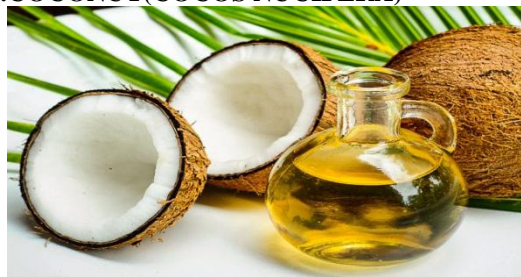
Figure. No. 8