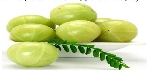
Figure. No. 9