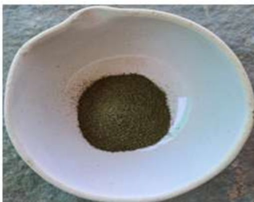
Fig; Curry leaves

Murraya koenigii possesses anti-inflammatory and antioxidant properties. It is effective for skin protection, skin glowing and helps in moisturising a skin.