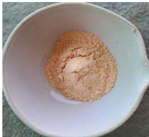
Fig; Red lentils