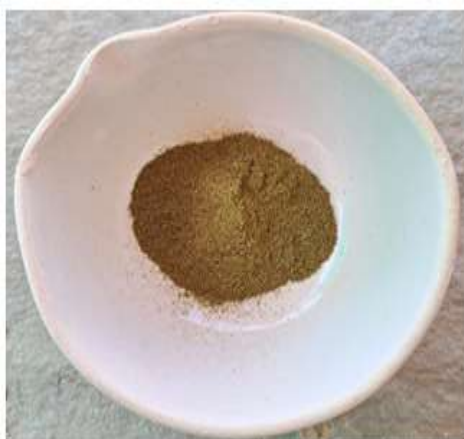
Fig; Moringa oleifera

Moringa oleifera has many nutrients which are healthy for your skin including vitamin A, which builds collagen the vital component that your skin is made of. It has vitamin C that helps to fight the signs of ageing. Moreover, moringa has vitamin E that has anti-inflammatory properties and also antioxidants in moringa help your skin from the sun’s damaging UV rays. Additionally, it has the ability to remove blackheads, pimples and clear skin.