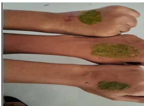
Fig: Irritancy Test