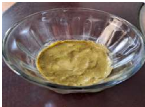
Fig; Prepared Face Pack