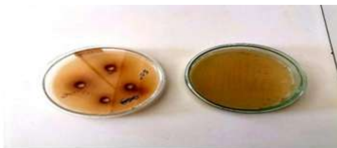
Fig 5.4: Zone of Inhibition of E. Coli by Herbal Mouthwash