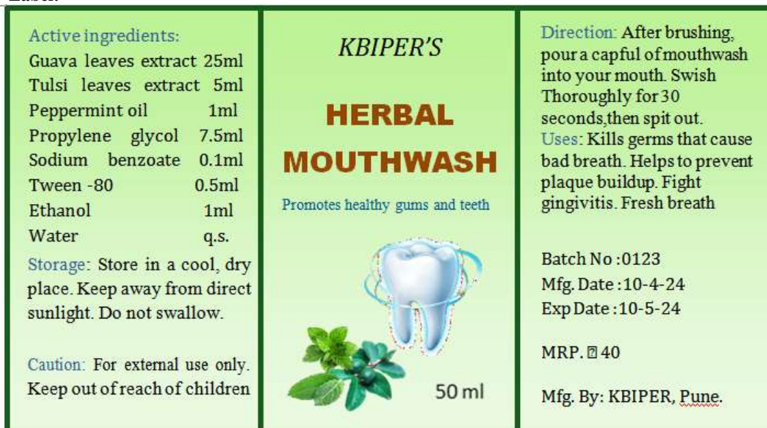
Fig 5.8: Label of herbal mouthwash