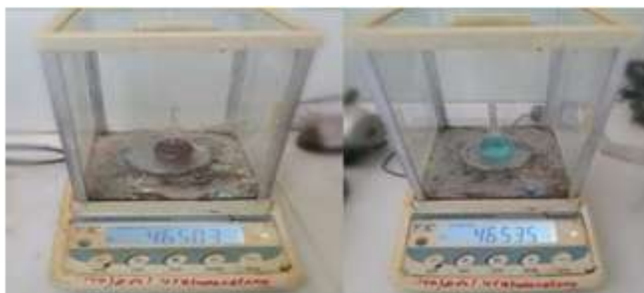
Fig 5.7: Density of herbal Mouthwash