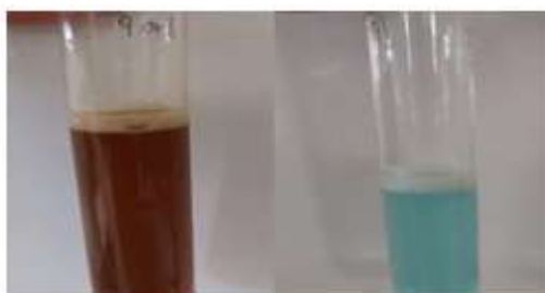
Fig 5.5: Foam test of herbal Mouthwash