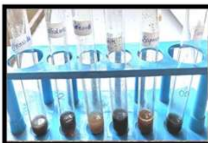
Fig 5.1: Phytochemical Test Guava Extract Fig 5.2: Phytochemical test of Tulsi extract