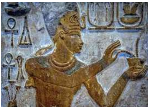
Figure 5 The origins of lip care

The history of lip balm can be traced back to earwax, and Charles Browne Fleet began commercializing it in the 1880s. This product, later called "ChapStick," became a household name. More than 40 years before Swift introduced lip balm to the market, Lydia Maria Child suggested in her enormously popular book The American Girl that chapped lips might be treated with earwax (6).