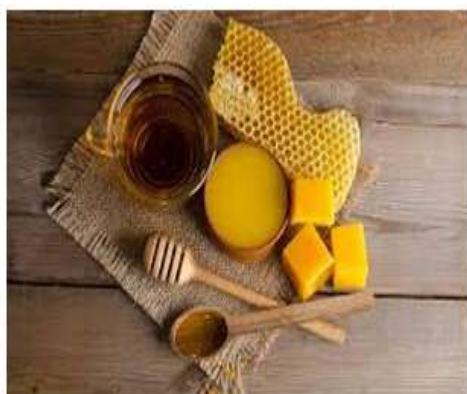
Figure 1 Bees wax

a) Bees wax: Beeswax is a water-resistant substance that has been used in cosmetics. In cosmetics, it serves as a thickening, emulsifying, and stiffening ingredient. Bee wax has the potential to aid with skin hydration. Beeswax is a naturally occurring emollient that helps to keep lips hydrated, shield them from the sun and wind, and keep their skin from being dry and irritated. Bee wax has softening and lubricating properties. Vitamins, minerals, and antioxidants found in beeswax are good for the skin.(11).