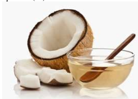
Figure 2 Coconut oil

Lauric acid, which is present in coconut oil, has nourishing, anti-fungal, and anti-microbial qualities.(11).