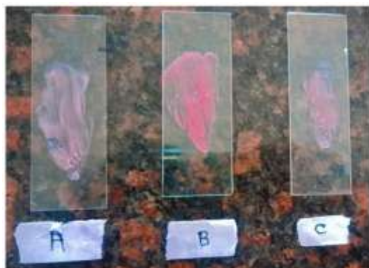
Figure 10: Spreadability test

of the lip attar, without any deformation at room temperature.