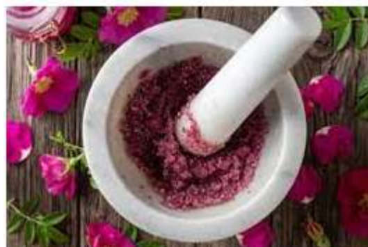
Figure 4 Rose petals

d) Rose petals: Rose petals can be used as an effective treatment for lightning dark lips. Rose petals are good source of vitamin C, iron, calcium, vitamin A. It exhibits a curious property known as hydrophobicity.(11).