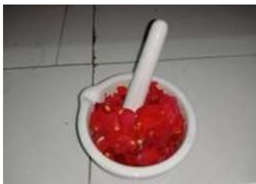
Figure8:Preparation of Rose petal soil extract