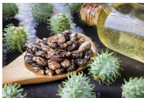
Figure 3 Castor oil

c) Castor oil: Castor oil which helps to moisturize, smooth and glossy lips. Castor oil has wound healing properties.