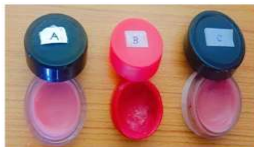
Figure 9: Natural lip balm by using rose petals

Prepared lip balm has shown faint pink colour with pleasant odour. All results are presented are as follows: