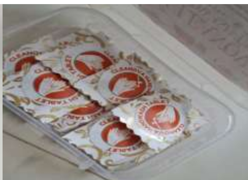
Figure 1b: Packaged Handwash Tablets