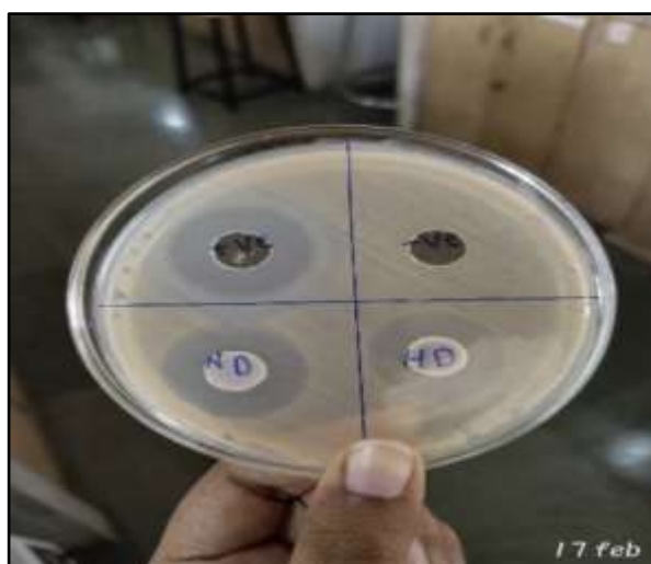
Figure 3: Zones of Inhibition

CAM assay: The summary of lysis, haemorrhage and coagulation time for control saline, irritant 0.1N sodium hydroxide and F2 of herbal handwash