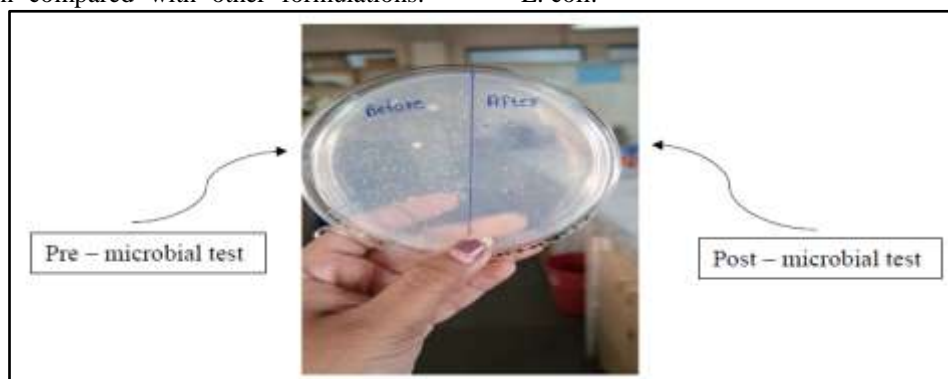
Figure 2: Pre and Post Microbial test of F2

The results are seen in Figure 2 . Hence, this formulation was evaluated further for its drug content, safety and efficacy against S. aureus and E. coli .