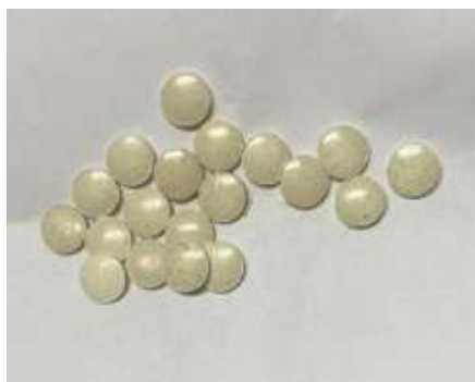
Figure 1a: Handwash Tablets

granules. The granules were dried to the desired moisture content. The dried granules were blended with the post-granulating agents to ensure uniform distribution. The final blend was compressed into tablets using an appropriate tablet punching machine with the die of 12mm. The tablets were individually packed in paper wrappers, and then ten packets were stored in a plastic container under appropriate conditions.