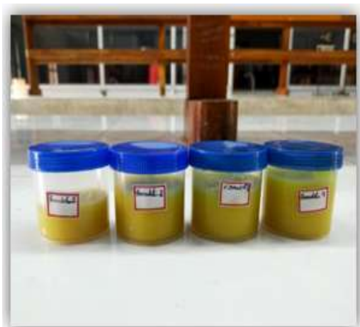
Fig.no.1: Anti-microbial ointments