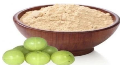
Fig no 3. Amla [Indian Gooseberry]

Consist of plant life of plant hibiscus rosasinesis. own family-malvaccae us united states-hair growth pastime , anti oxidant, anti- dandruff, phenolic compound. Hibiscus is certainly enriched with calcium, phosphorus, iron ,diet B1, diet C, riboflavin, which assist to sell thicker hair growth and decreas premature graying of hair.