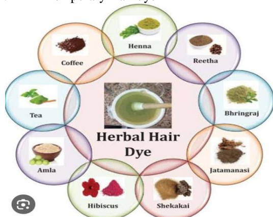
Formulation And Evaluation Of Herbal DYE(9)