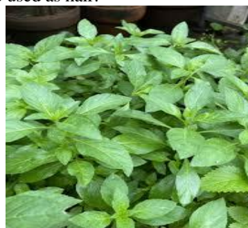
Fig no 11. TEA

In hair colorants, herbs can be used inside the form of powder, aqueous extract or their seed oil to effect shades of distinct coloration various from reddish brown to blackish brown. The natural medicines like coffee kohl captured from its seeds are used as hair.