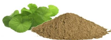
Fig no 8. BRAHMI POWDR

The hypothesis is that the wealthy vitamins in curry leaves can help to save you thinning hair or hair loss. The leaves may additionally assist eliminate useless hair follicles, that can intrude with hair increase. Curry leaves are generally known as kadipatta. It's miles one of the most common family substances that are effortlessly determined in maximum Indian kitchens. It's miles just any other spice that provides flavour to dals, chutneys, soups, and stews. However you realize what they have got a lot extra to offer than simply delivered flavour on your meals.