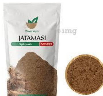
Fig no 9. Jatamansi

Regular use of Brahmi strengthens your hair roots and keeps them very well maintained. This spice is full of supplements that can help your hair. Thanks to its biochemical organization, yes successful in the treatment of short baldness. It's about hair growth.