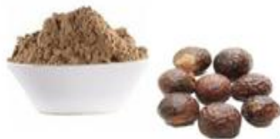
Fig no 4. REETHA

Its botanical name is the dried powder of emblica officinalis. Family -euphorbiaceae. Next to tannins, Amla is the most extravagant and concentrated type of vitamin C found among plants. The vitamin C found in the natural product is incompatible with tannins which protects it from loss by intensity or light. Amla powder is also abundant tannins, minerals such as calcium, phosphorus, Fe and amino corrosive substances. Natural product to extract it is valuable for hair development and reducing baldne