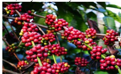
Fig no 10. COFFEE

Dried roots of the Nardostachys jatamansi plant. Family- Caprifoliaceae. Jatamansi root are converted into a paste and apply to the scalp to promote hair growth. Jatamansi is an important drug in ayurveda and other traditional systems of medicine like ayurveda, unani, siddha, etc. is used. Beneficial for smooth, silky and healthy hair.