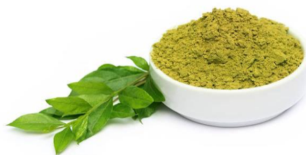
Fig no1. HENNA

The botanical name of Henna is Lawsonia inermis that's the simplest species of the