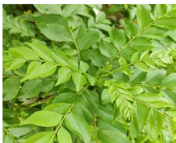
Fig no 7. Curry leaves

The botanical name of Bhringraj is eclipta alba . The family is Asteraceae. Chemical component; the plant contains the alkaloid ecliptine. Other identified chemicals are wedelolactone, wedelic, apigenin, luteolin, b-amyrrin, etc. It is used - it will save you hair and premature graying. It also stimulates hair growth.