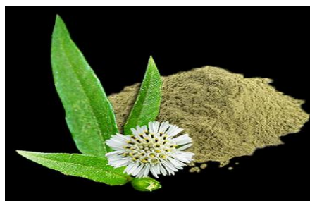
Fig no 6. BHRINRAJ

Shikakai is a wonderful spice commonly found in the tropical forests of India. They consist of the dry fruits of Acacia conicinna. Family – Leguminosae Shikakai contains highly cleansing properties, this way it works best as a cleanser substitution. shikakai is rich in cell strengthening and nutrients such as A, C and K which it has a major effect on making hair healthy and shiny. Used - good cleanser, against dandruff.