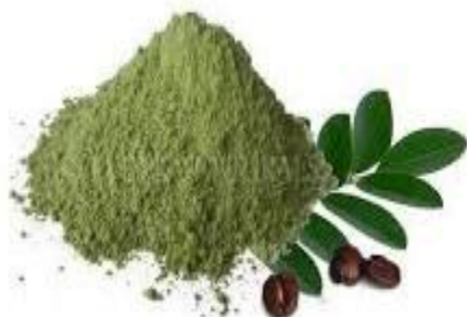
Fig no 13. Indigo powder.

Indigo powder conditions and nourishes the hair base and makes each strand of hair more grounded. Indigo powder prevents scalp diseases and uses it with the advances of coconut oilscalp with each of the supplements and makes the hair stronger and smoother.