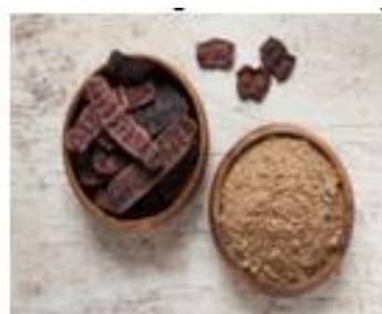
Fig no 5. SHIKAKAI

Consists of the dried fruits of the Sapindus mukorossi plant. Family- sapindaceae Sapindus mukorossi, commonly known as Indian soap berry, wash or ritha, reetha as soap nuts or washing nuts, have played an important role as natural hair care products since ancient times. Its fruits are a source of vitamins A, D, E, K and saponin, sugars, fatty acids and mucilage. It is used to promote hair growth and reduce dandruff, hair cleaner.