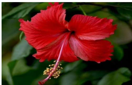
Fig no 2 .Hibiscus

of a pink dye molecule called lawsone [2-Hydroxy-1-naphthoquinone], which has the potential to bond with the protein. It is also used in shampoos, conditioners. It also prevents premature hair fall by means of balancing pH of scalp. It's also used in jaundice, skin disease, smallpox.