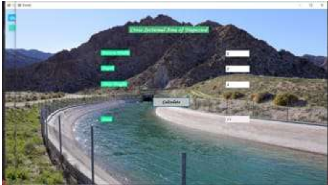
Fig.4.4 Chezy's Equation