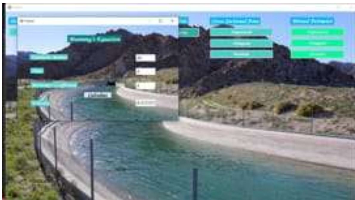
Fig.4.3 Manning's Equation