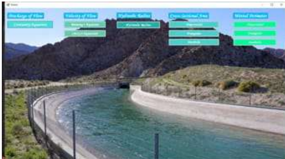
Fig. 4.1 Main Page