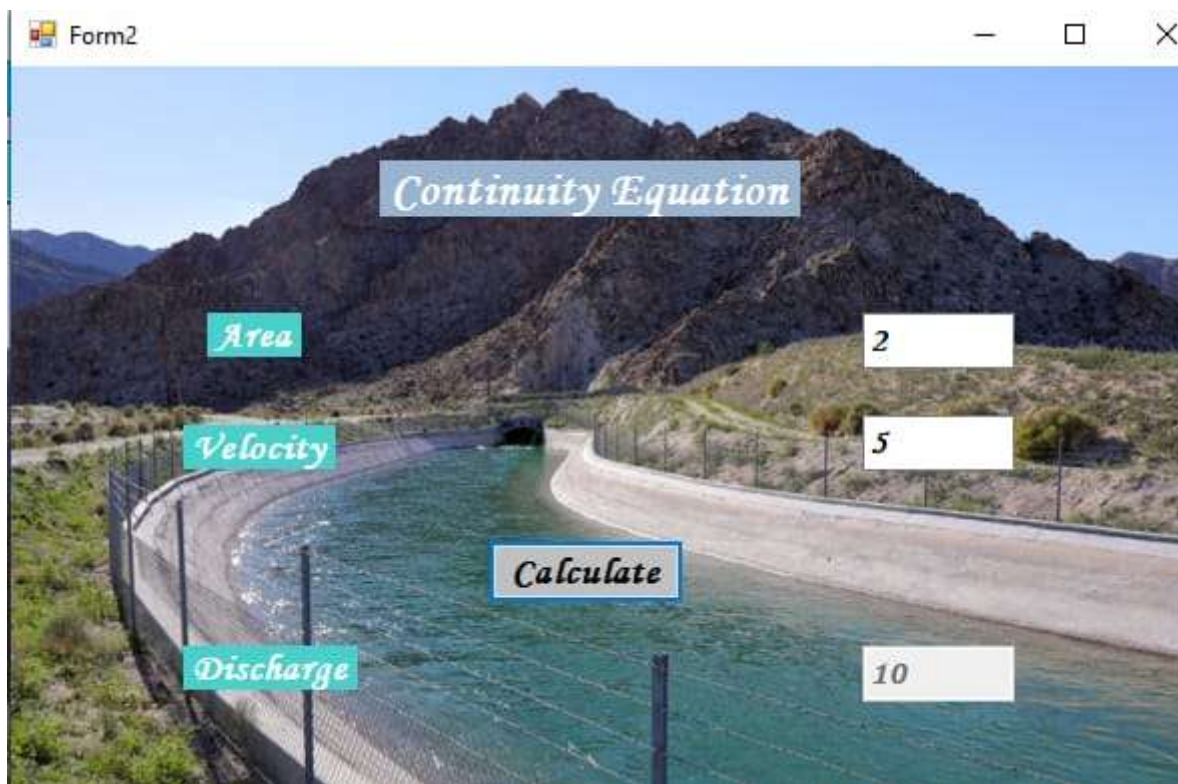
Fig.4.2 Continuity Equation