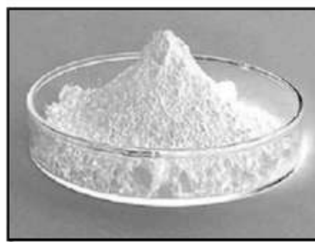
Fig. Escitalopram API

Escitalopram, the S-enantiomer of citalopram, is an antidepressant that primarily works by inhibiting the reuptake of serotonin in the brain, thus increasing serotonin availability. Since escitalopram is widely used in clinical practice, it is crucial to have robust analytical methods to determine its concentration in both pharmaceutical formulations and biological fluids for quality control and therapeutic drug monitoring. Analytical methods must not only be precise but also sensitive, accurate, and reproducible to ensure patient safety and drug efficacy. This review outlines the various methods developed for the determination of escitalopram, their validation procedures, and regulatory standards.