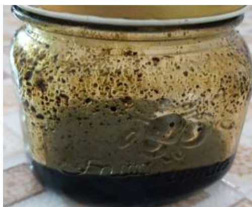
Figure 1. Pegagan extract

Drying with an oven can reduce the moisture content regularly in a relatively short time. High water content can be a medium for mold growth and also certain enzymes contained in cells so that they can decompose the active compounds present in simplicia. With drying, the water content will be reduced and the reaction of enzymatic decomposition of compounds can be prevented thereby increasing the shelf life of simplicia. Pegagan was macerated for 36 hours in a solution of 70% ethanol to extract the substance because it can best extract the active components in pegagan. Because it is simpler, requires less equipment, and does not include heating, the maceration method was chosen to prevent harm to the active ingredients found in pegagan.