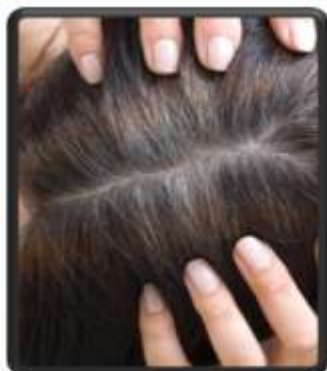
Before applying hair dye