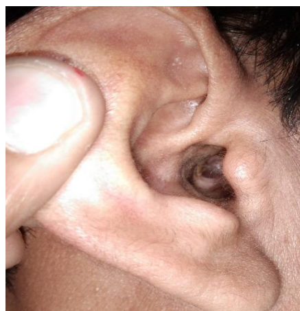
Figure 2: After Treatment